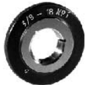
NPT Thread Ring

NPT — L1 THREAD PLUGS ARE SUPPLIED WITH ONE STEP AS STANDARD. NOTE: FOR NPT 2-STEP OR 3-STEP LIMIT PLUG MEMBERS ADD $57.00 PER MEMBER. ADD 20% FOR HARD CHROME GAGES