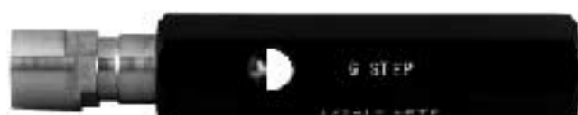
NPTF 6 Step Plug with Handle