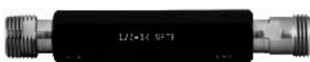
NPTF L1 and L3 with Handle