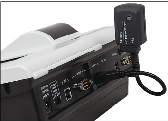
* SJ-410 Series with U-Wave Technology